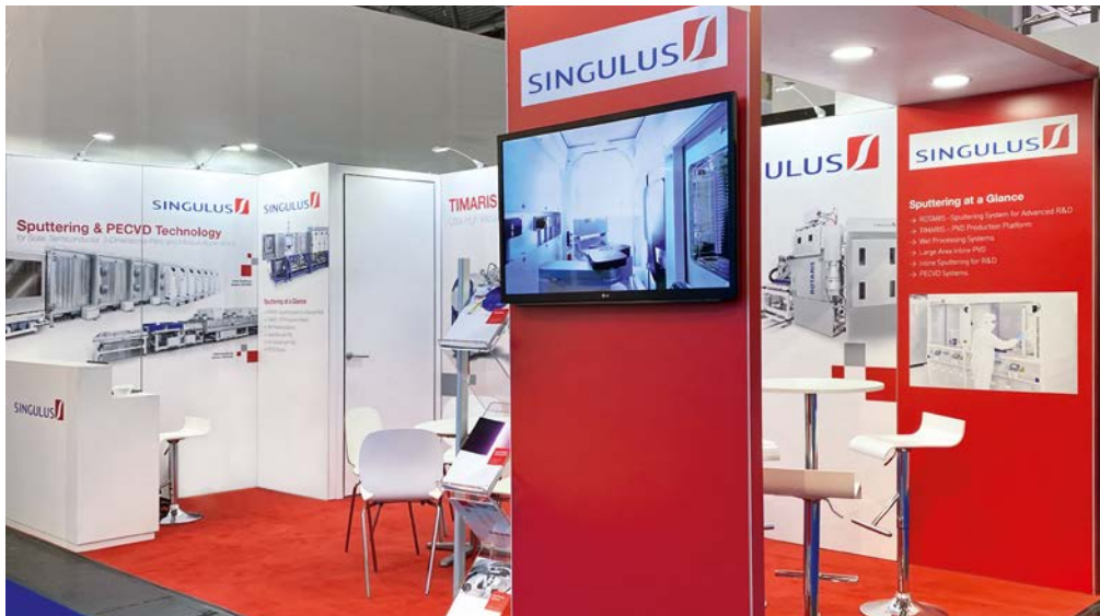
SINGULUS TECHNOLOGIES presents its product solutions for semiconductor technology at the SEMICON Europa 2019 in Munich

In the semiconductor market SINGULUS TECHNOLOGIES operates as a provider for specialized machines and offers the machine platforms TIMARIS and ROTARIS and now has also included the process solutions for the cleaning of electronic components and semiconductor applications in this segment. For the growth areas of applications of sensory equipment as well as for semiconductor-based capacitors the company experiences increasing interest in the developed machine concepts and expects the first successes in the market in the coming months.