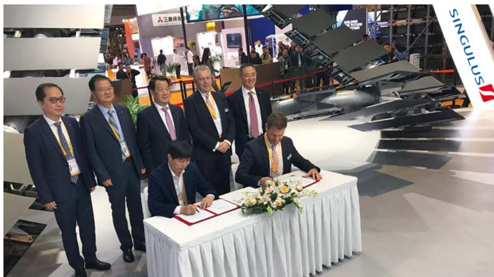
Signing Ceremony at the Chinese fair CIIE in Shanghai