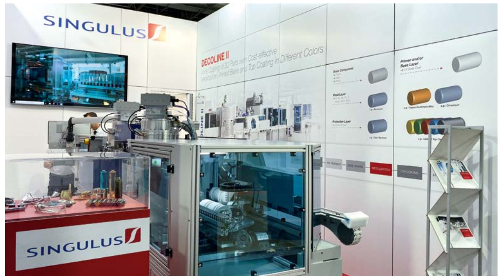
SINGULUS TECHNOLOGIES presents the POLYCOATER coating system for 3D components at the K trade fair in Dusseldorf

In the period under review the orders for a production line of the DECOLINE II type for the finishing of three-dimensional components as well as for several vacuum coating machines of the POLYCOATER type were received. For the cosmetics sector the POLYCOATER offers the ability to finish a wide range of products due to its flexibility. With the POLYCOATER SINGULUS TECHNOLOGIES offers a technological and