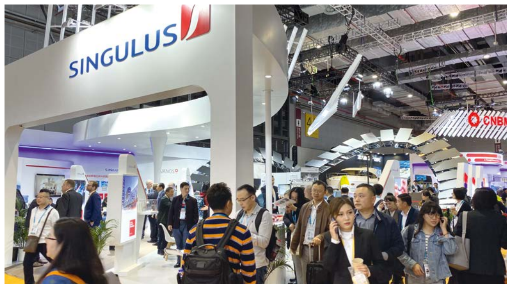
SINGULUS TECHNOLOGIES booth during the CIIE in Shanghai

From our point of view the sales prices developed as planned during the first nine months of the business year. Material and personnel expenses also developed as planned. However, the price situation in the Solar segment strongly depends on the future developments of demand in this market.