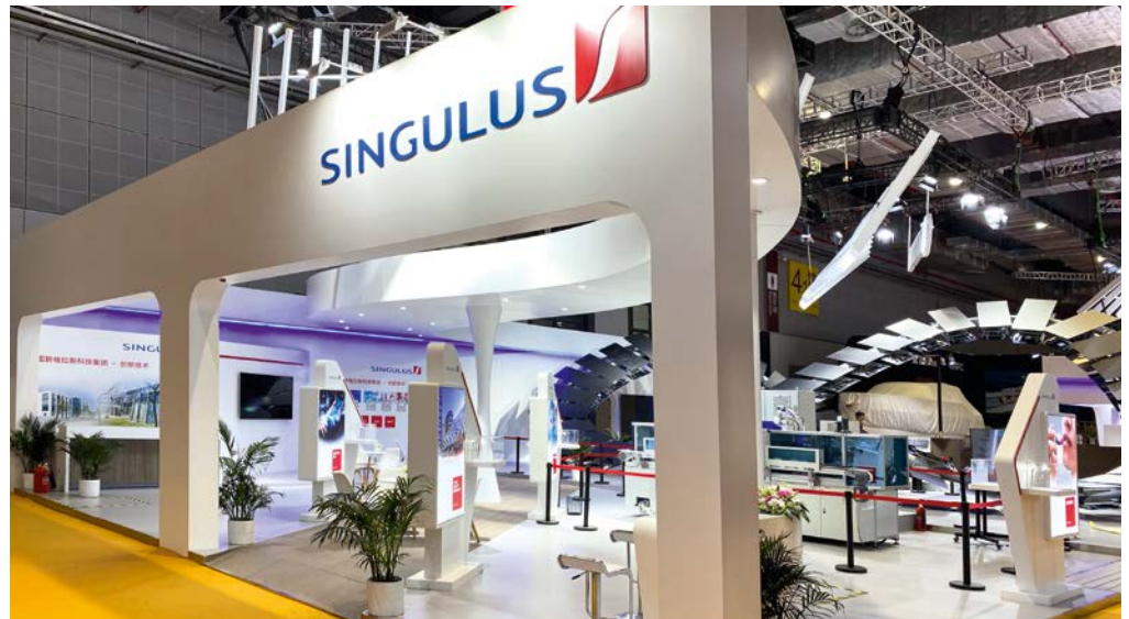
SINGULUS TECHNOLOGIES' booth at the China International Import Expo 2019

The headcount within the SINGULUS TECHNOLOGIES Group increased slightly to 358 employees as of September 30, 2019 (December 31, 2018: 343 employees).